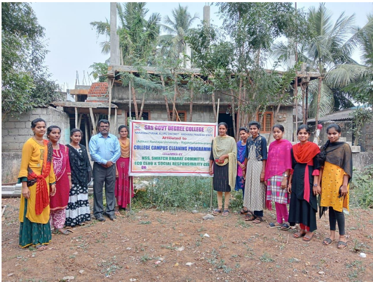
Staff and students in campus cleaning activity