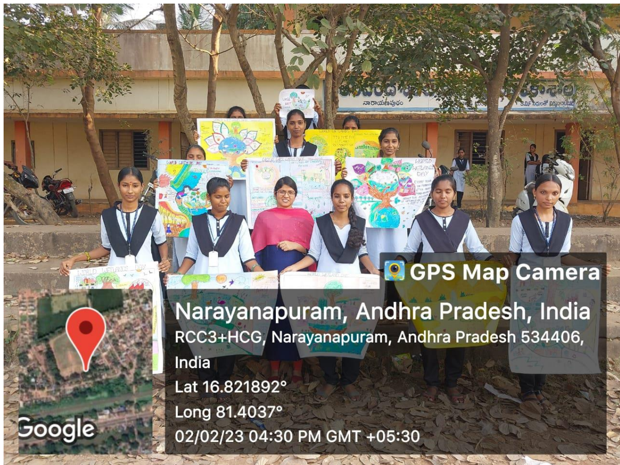
Students with their posters on Ways to conserve wetlands