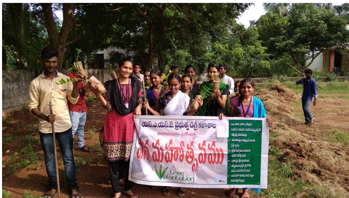
Faculty and students participating in vanamahotstavam