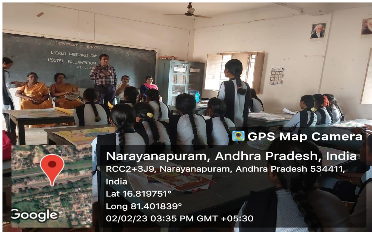
Faculty and students in poster presentation competition

No.of Participants: 20 Students + 11 Teaching faculty