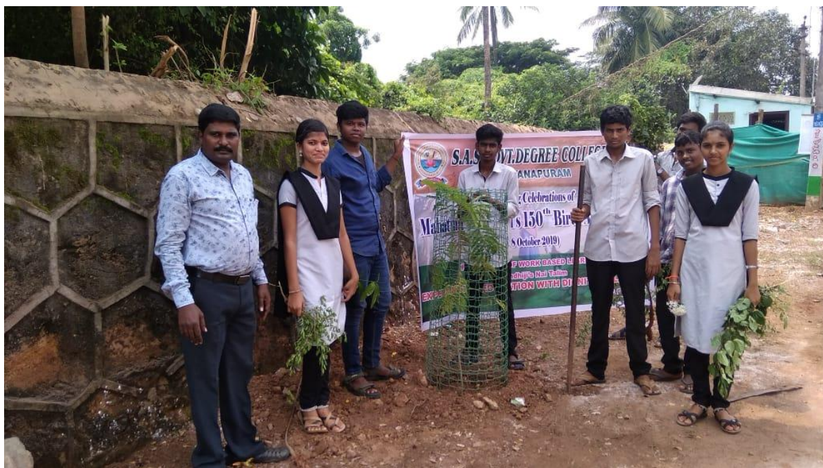
Students and staff arranging the tree guard