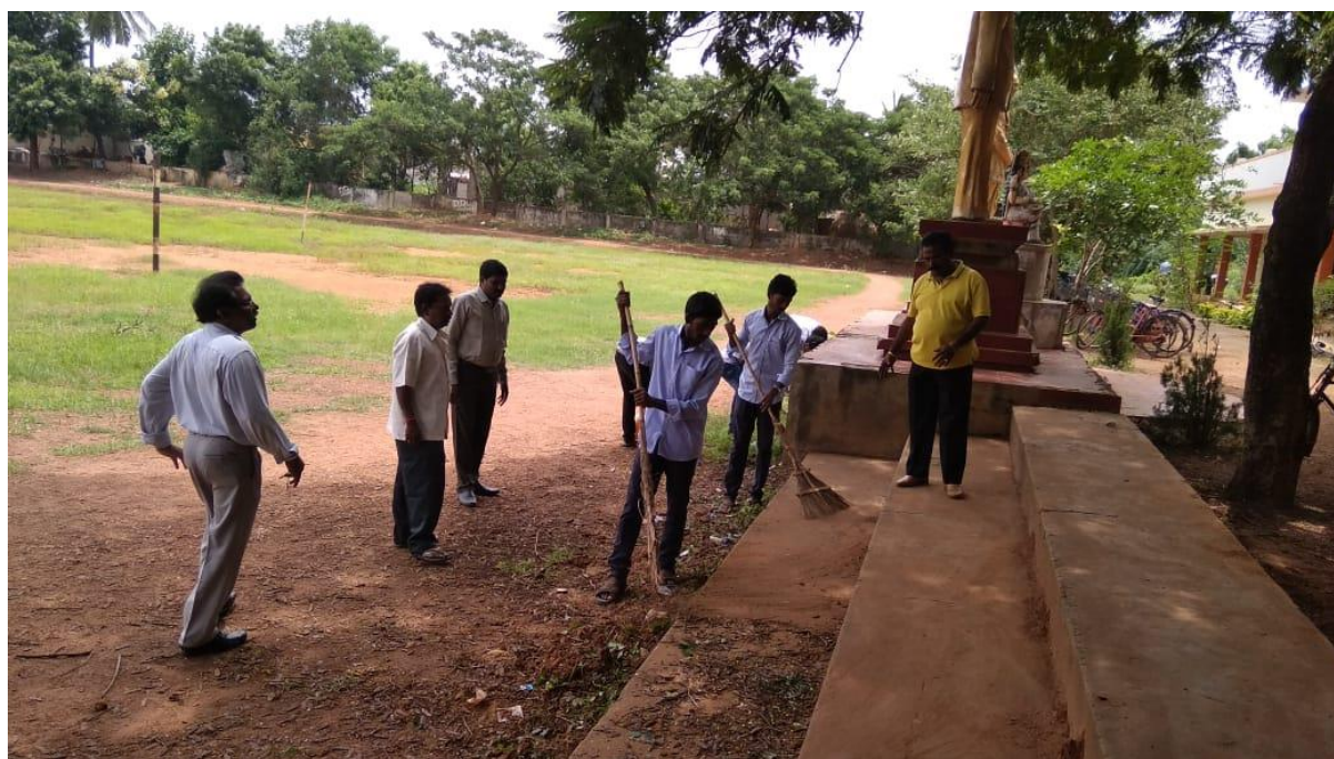
Staff and students engaged in the removal of plastic wastes